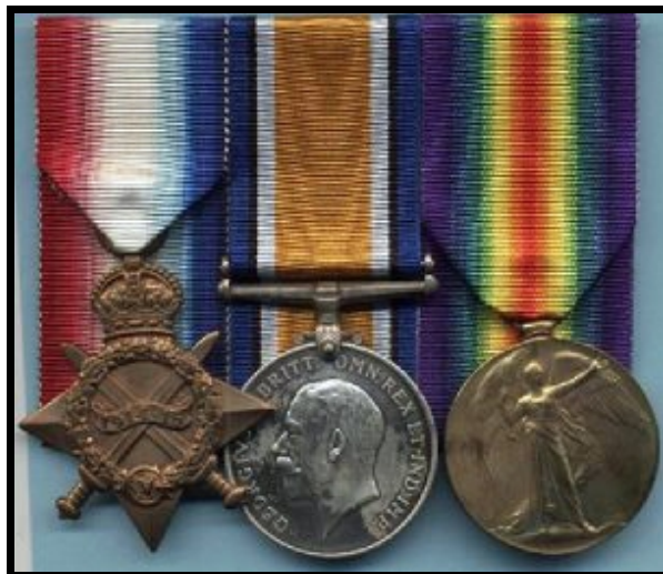
From Left 1914-15 Star, British War Medal and Victory Medal